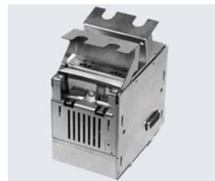
SRIPEM DIN Rail Module with four Universal Digital Inputs